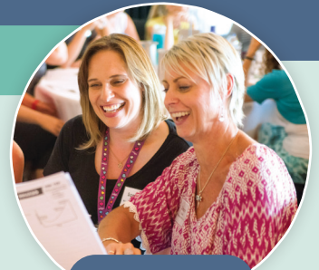
FACE-TO-FACE OR ONLINE

In this fun and interactive workshop, our expert presenter will train your teachers in the simple and powerful secrets to rapidly improve student engagement and writing outcomes.