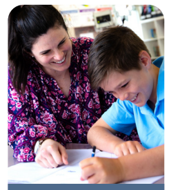
FACE-TO-FACE OR ONLINE

Transform students' persuasive and informative writing. Learn how to apply the Seven Steps at every stage of writing – from brainstorming and planning to feedback and revision.